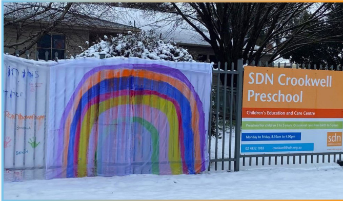
Above: Snowed in SDN Crookwell, 30 August 2021

spoke of the pride her team feels in their ongoing work: "Our team at SDN Crookwell Preschool wishes to continue to achieve high standards for our Crookwell community. We want families to continue to feel confident in the care and education their children receive from us. We hope families feel included and develop warm relationships with each other and our educators. We wish for the children to feel joy and that they love attending our preschool."