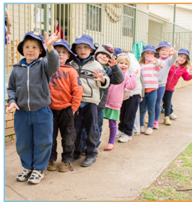
Above: Children playing outdoors at SDN Crookwell, August 2013

- Pru Goward MP for Goulburn in response to SDN Crookwell's Makespace proposal, Crookwell Gazette , 2 July 2018