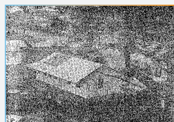
Above: Bird's eye view of Preschool, original building old Roslyn schoolhouse - June 10, 1980

During the 1960s the Crookwell community recognised the need for preschool facilities, but getting one up and running was no easy task. The local community rallied around to raise funds and repurposed some of the town's existing buildings for the original Crookwell Preschool, which opened on 16 June 1970.