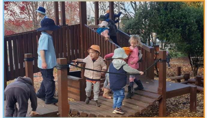
Above: 'Big schoolers' from Crookwell Public School visiting, May 2021