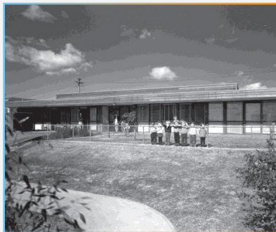
Above: House at Pooh Corner - exterior of building with children at fence 1970.

parents and carers to assist with the daily cleaning of the centre in return for reduced fees. The waiting list continued to grow, which was testament to the high-quality service being offered. The demand for onsite childcare became so great that the Student Guild arranged for a childcare centre in nearby Coogee to take some of the children on THPC's waiting list.